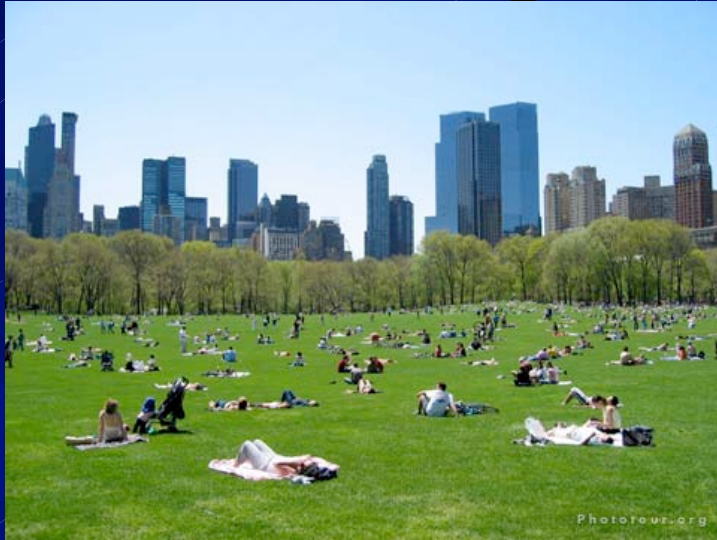
Central Park , NYC