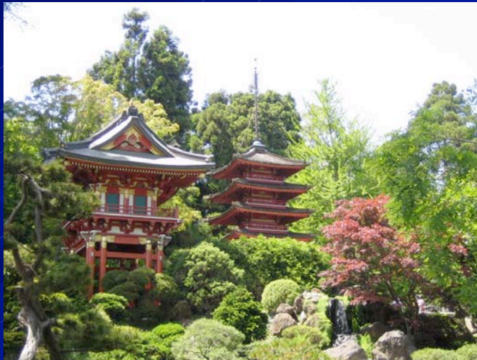
Golden Gate Park San Francisco, CA