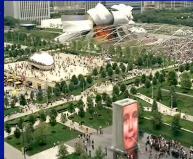
Millennium Park, Chicago