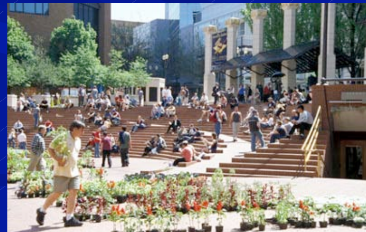
Pioneer Courthouse Square Portland, OR