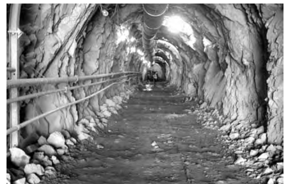
The Lake Hodges Pipeline tunnel connects Hodges and Olivenhain reservoirs.

Hodges Projects will also generate 40 megawatts of peak hydroelectric energy – enough power to annually sustain nearly 26,000 homes.