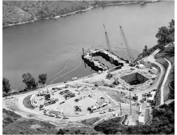
Once the construction projects are complete, community input will be incorporated to restore the native landscape on the project site.

Electricity generated by the pump turbines will be transmitted to an outdoor switchyard, then to a 69 kilovolt power line that will connect to the existing local transmission system.